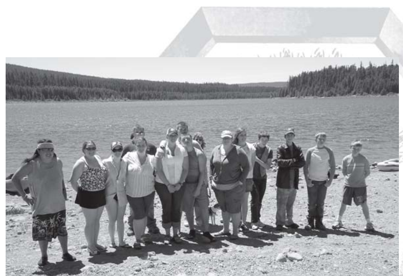
2010 Yourth Clear lake Campout!