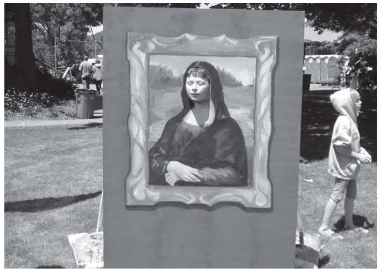
"Art in the park" field trip