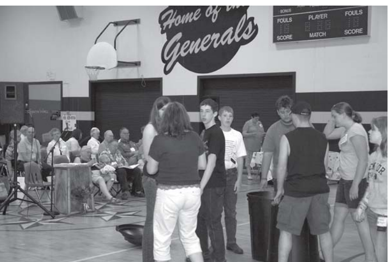
"And the next winner is Sand Lake Grange!"