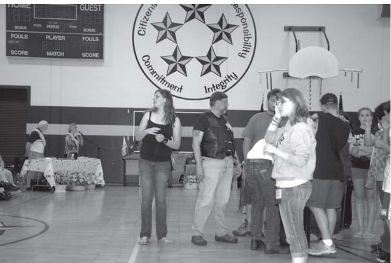
The Youth Grange Goodie Basket Drawing is about to begin!