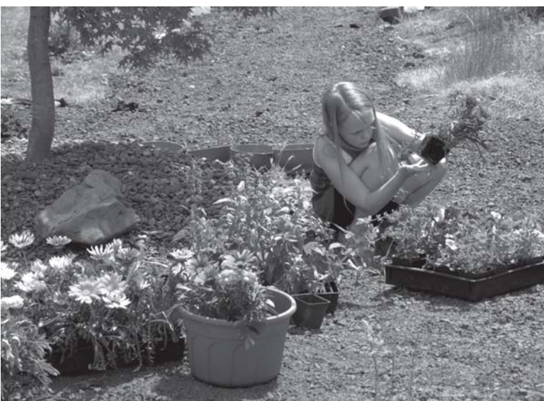
Juniors Pot plants as "thank you" gifts for their parents. Plants and pots were donated by Herrick Farms