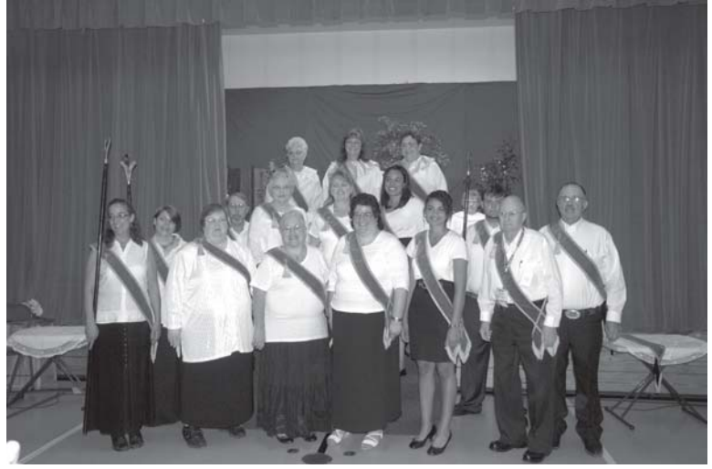
The fifth degree installation team!