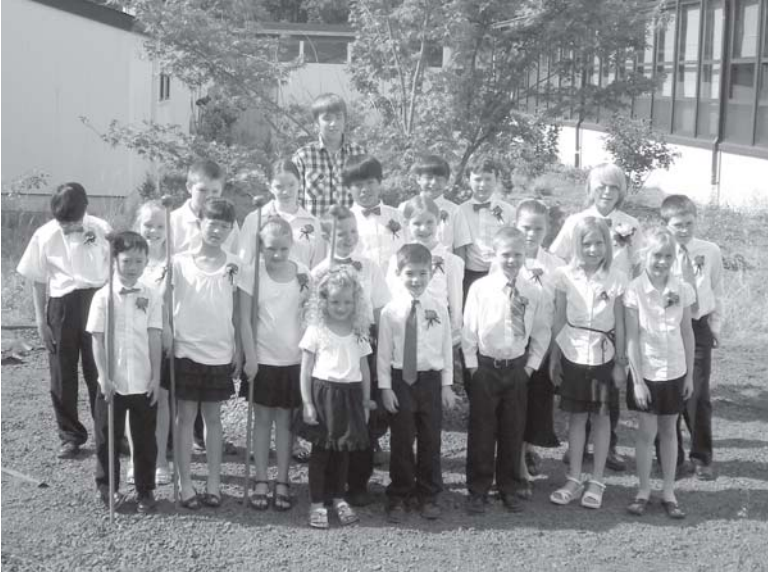
2010 Junior officer Group shot