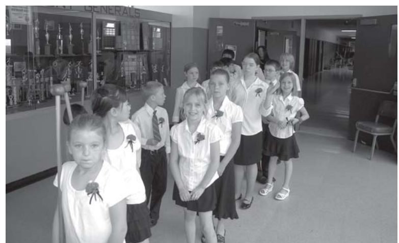
Junior Grangers lined up and ready to open the Grange!