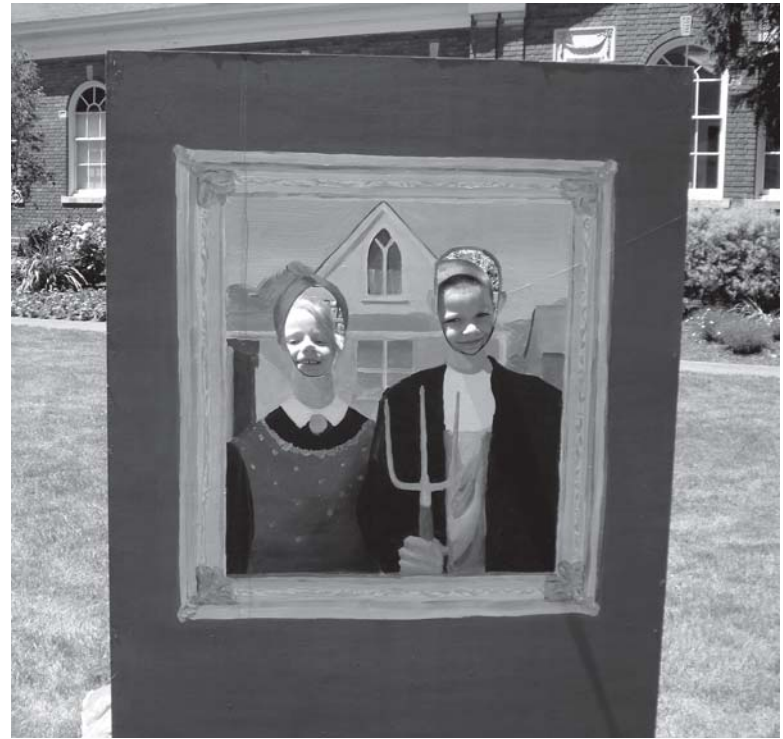
"Art in the park" field trip