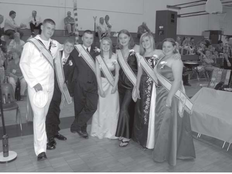
Some of the youth officers pose for a photo before they open the grange!