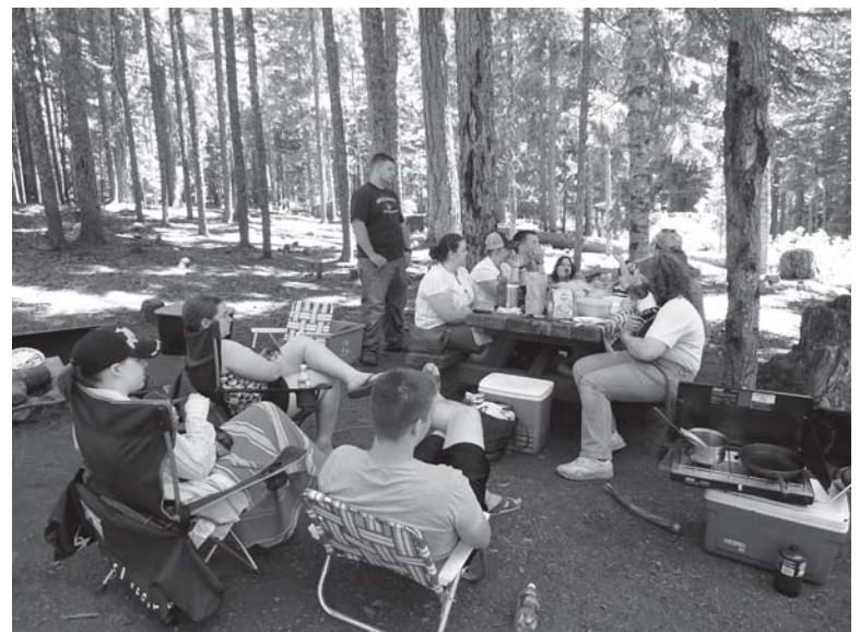
Clear lake Campout, rest in the shade!