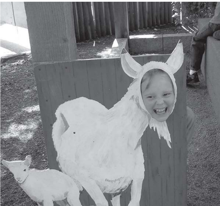
"Art in the park" field trip