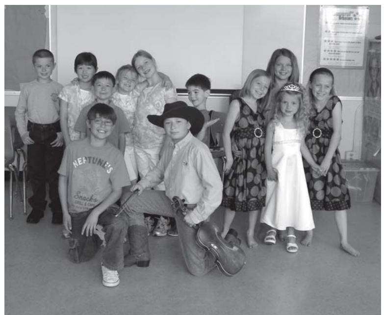
Junior talent show contestants