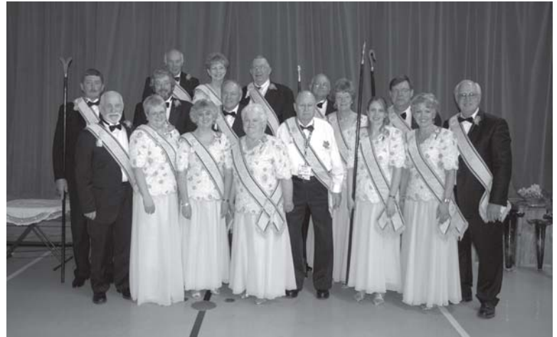
The sixth degree installation team!