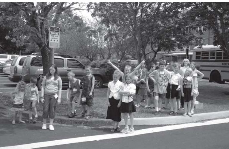
Community service field trip to the VA hospital.