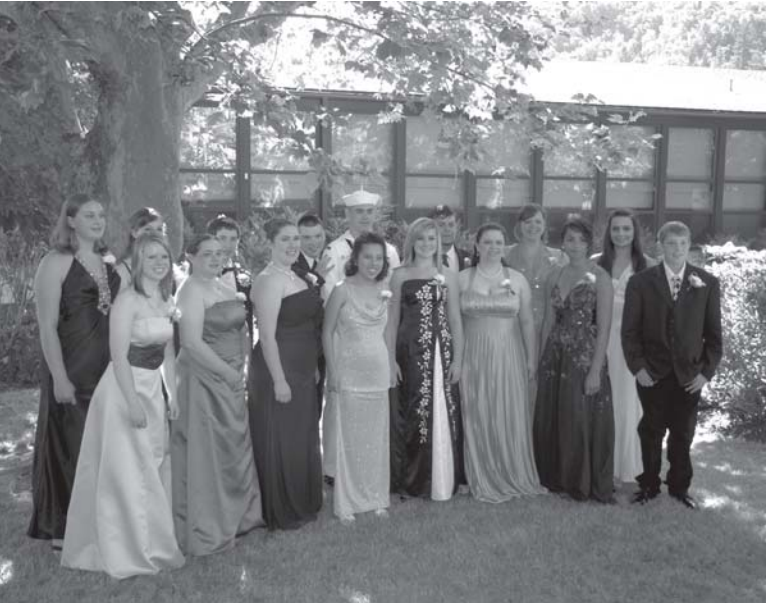
2010 Oregon State Grange Youth