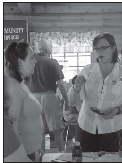
The youth hosted their day at the log cabin. Buttons were the game for the day.