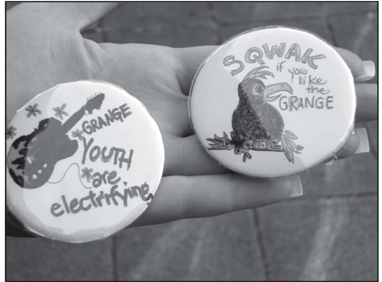
Kids visiting chose between 2 designs, colored their button, we created the button...